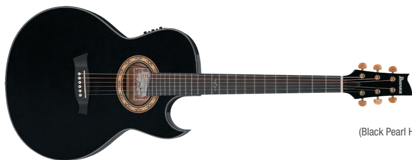
BP (Black Pearl High Gloss)