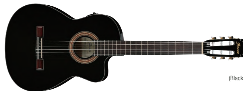
BK (Black High Gloss)