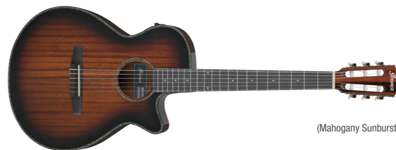
MHS (Mahogany Sunburst High Gloss)