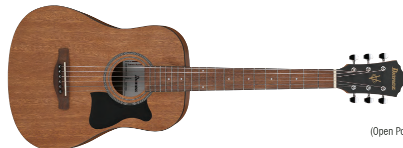
OPN (Open Pore Natural)