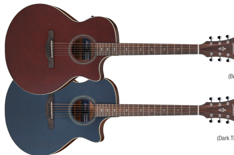
BUF (Burgundy Flat)