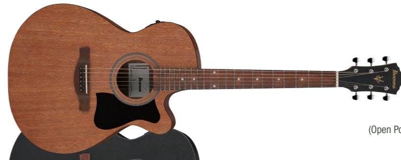
OPN (Open Pore Natural)