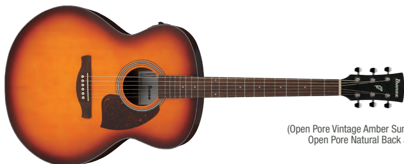
OAH (Open Pore Vintage Amber Sunburst Top, Open Pore Natural Back and Sides)