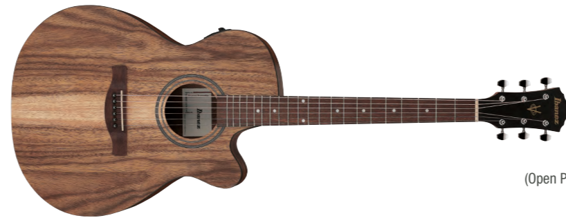
OPB (Open Pore Brown)