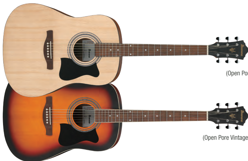
OPN (Open Pore Natural)