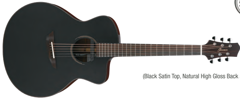
BSN (Black Satin Top, Natural High Gloss Back and Sides)