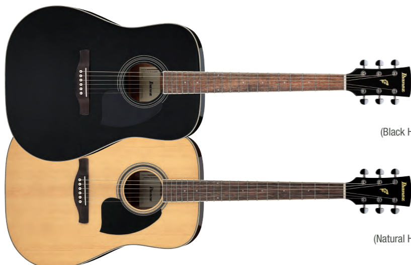
BK (Black High Gloss)