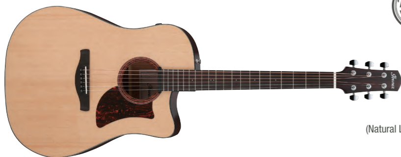
LGS (Natural Low Gloss)