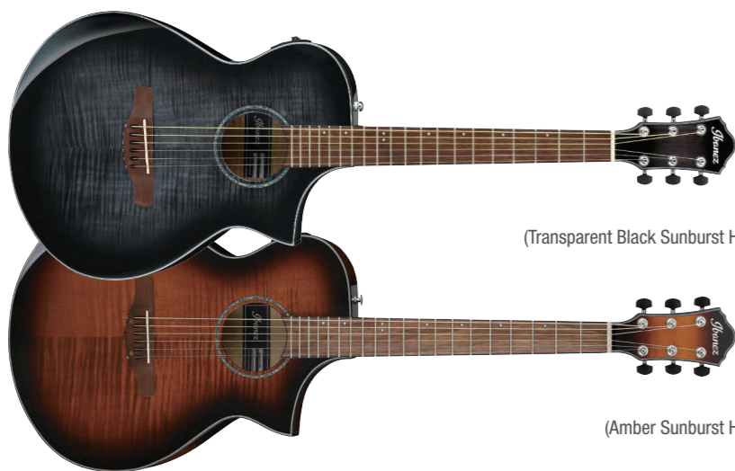
TKS (Transparent Black Sunburst High Gloss)