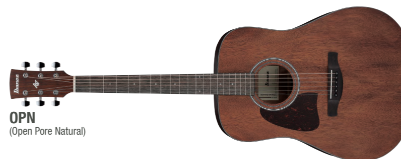
OPN (Open Pore Natural)