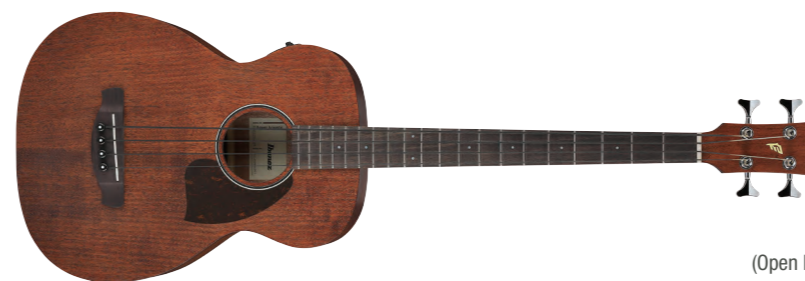
OPN (Open Pore Natural)