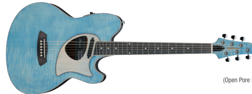
ODB (Open Pore Denim Blue)