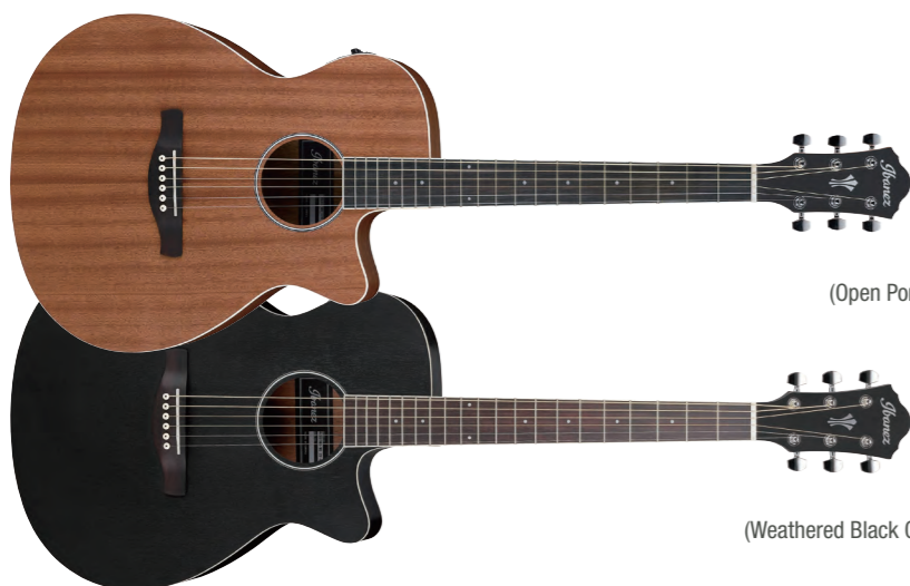
OPN (Open Pore Natural)