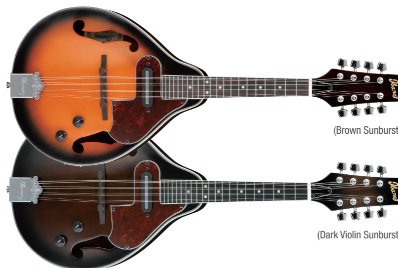
BS (Brown Sunburst High Gloss)