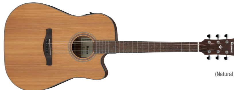
LG (Natural Low Gloss)