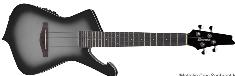
MGS (Metallic Gray Sunburst High Gloss)