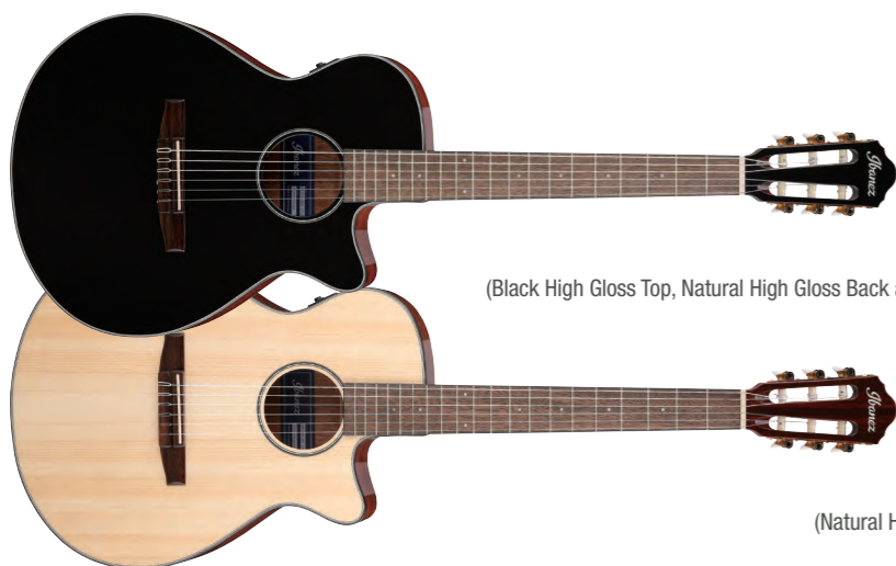
BKH (Black High Gloss Top, Natural High Gloss Back and Sides)