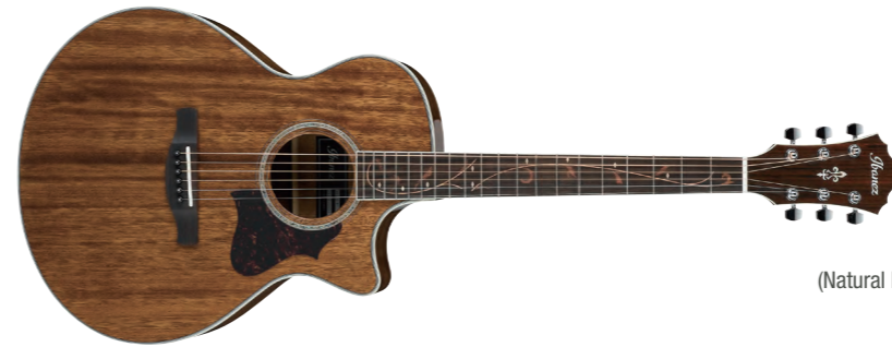
(Natural High Gloss)