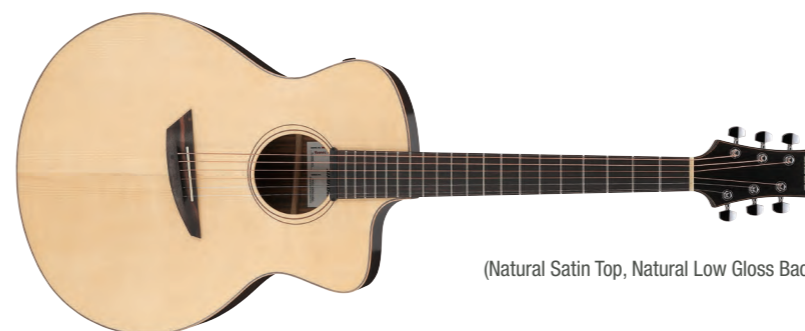
NSL (Natural Satin Top, Natural Low Gloss Back and Sides)