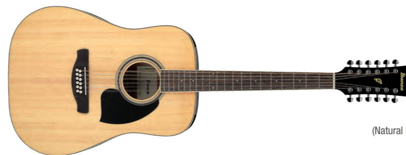
NT (Natural High Gloss)