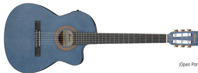
OB (Open Pore Blueberry)