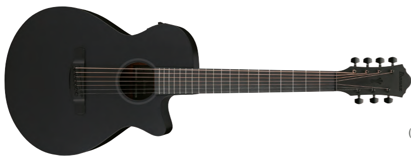
BOT (Black Out)