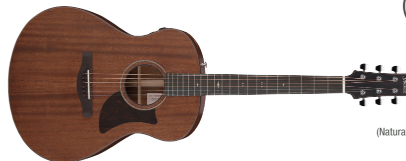
LG (Natural Low Gloss)