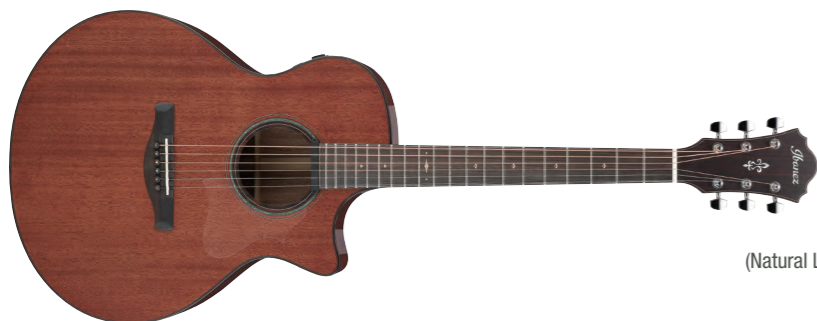
LGS (Natural Low Gloss)