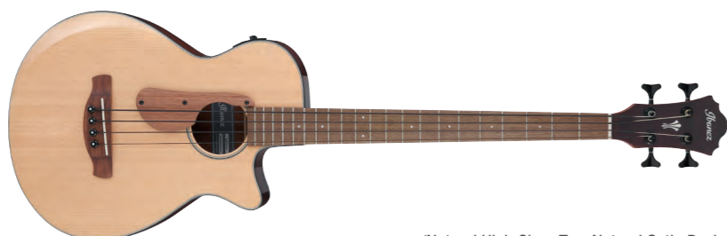
NTG (Natural High Gloss Top, Natural Satin Back and Sides)