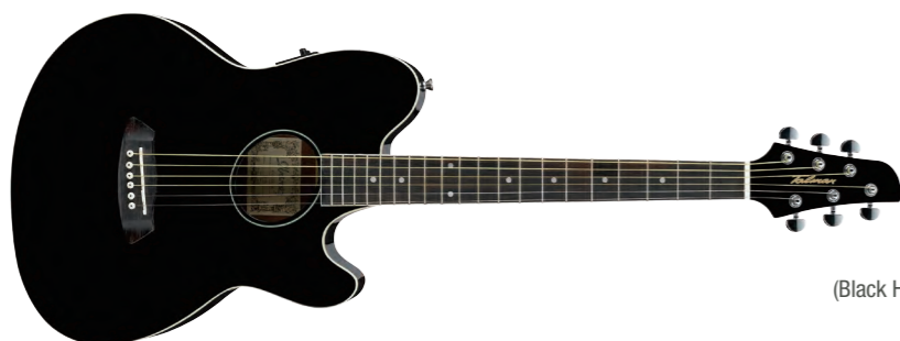
BK (Black High Gloss)