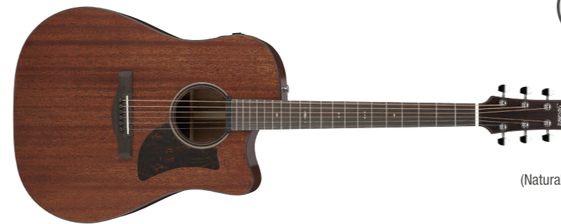
LGS (Natural Low Gloss)