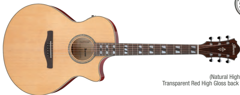
NTR (Natural High Gloss top, Transparent Red High Gloss back and sides)