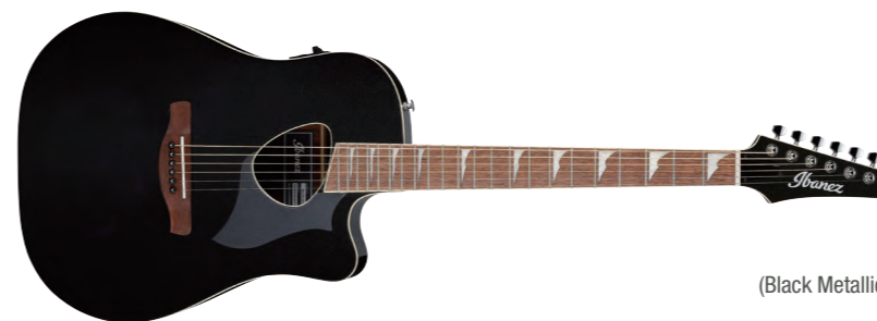
BKM (Black Metallic High Gloss)