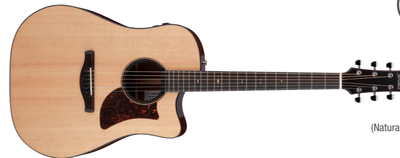
LGS (Natural Low Gloss)