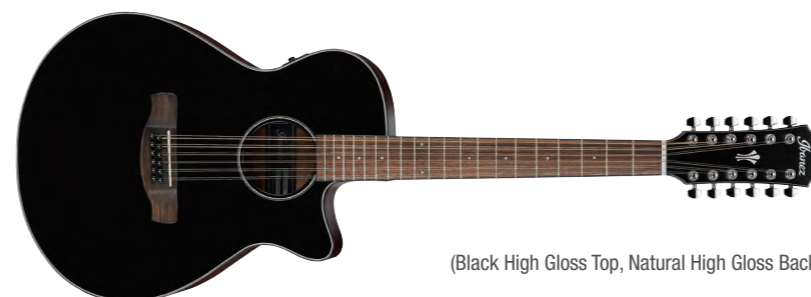
BKH (Black High Gloss Top, Natural High Gloss Back and Sides)