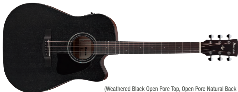
WKH (Weathered Black Open Pore Top, Open Pore Natural Back and Sides)