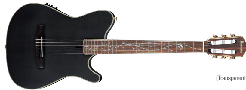
TKF (Transparent Black Flat)