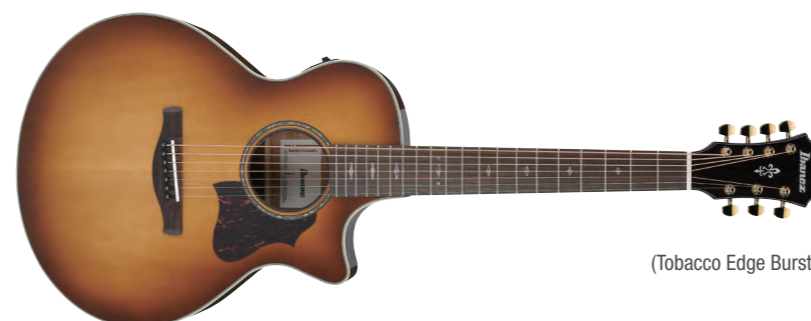
TBH (Tobacco Edge Burst High Gloss)