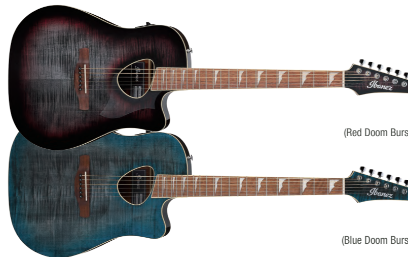
RDB (Red Doom Burst High Gloss)