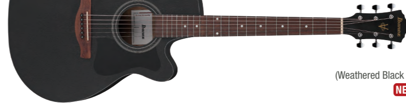
WK (Weathered Black Open Pore)