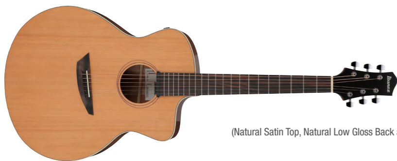
NSL (Natural Satin Top, Natural Low Gloss Back and Sides)