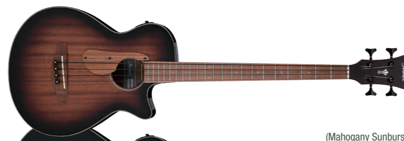
MHS (Mahogany Sunburst High Gloss)