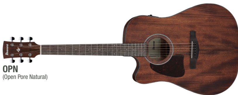
OPN (Open Pore Natural)