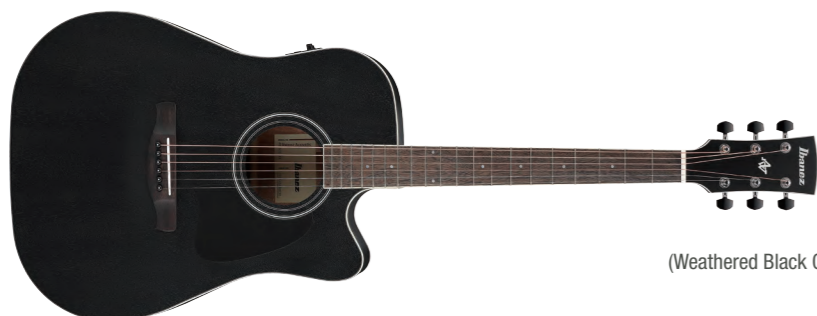
WK (Weathered Black Open Pore)