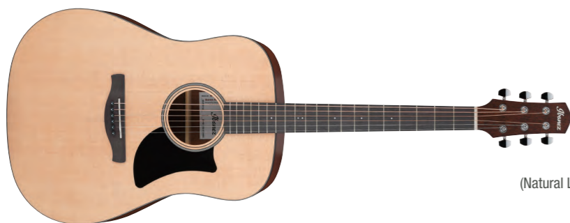
LG (Natural Low Gloss)