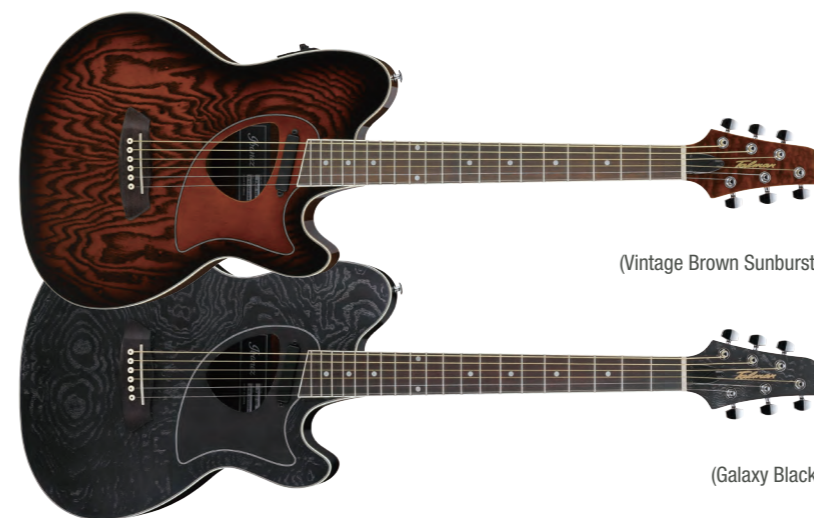
VBS (Vintage Brown Sunburst High Gloss)