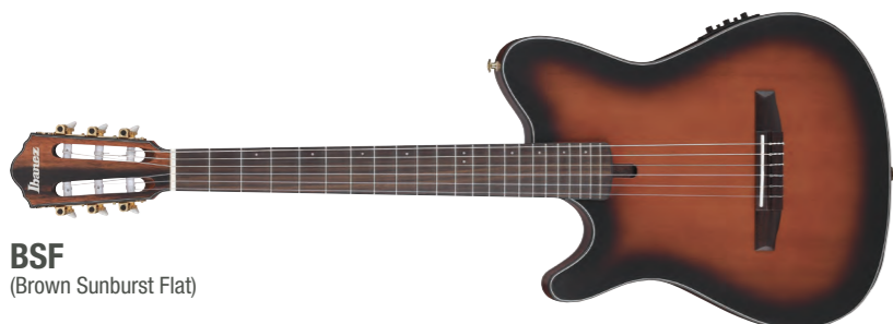
BSF (Brown Sunburst Flat)