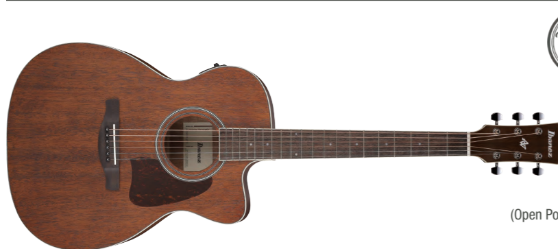
OPN (Open Pore Natural)