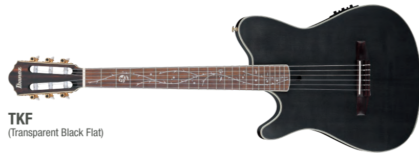
TKF (Transparent Black Flat)