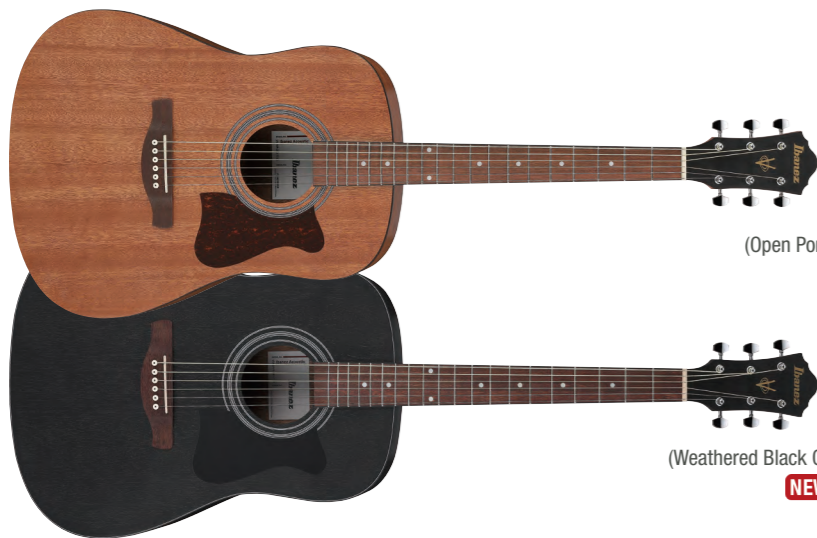
OPN (Open Pore Natural)