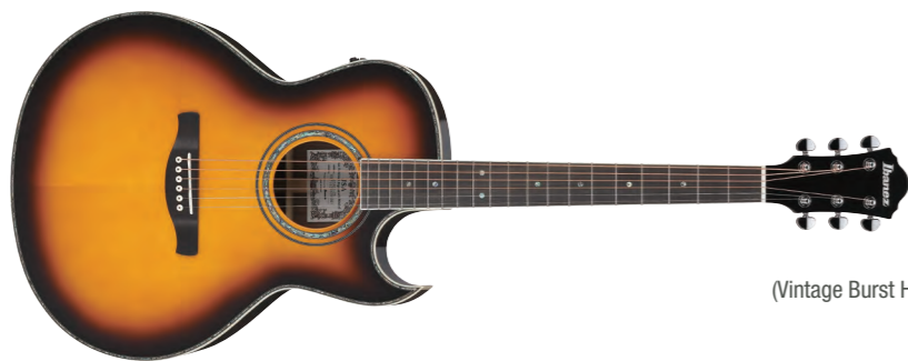
VB (Vintage Burst High Gloss)