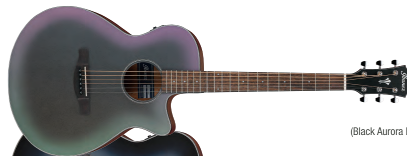
BAM (Black Aurora Burst Matte)