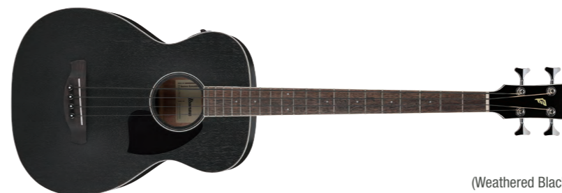
WK (Weathered Black Open Pore)