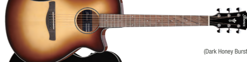
DHH (Dark Honey Burst High Gloss)