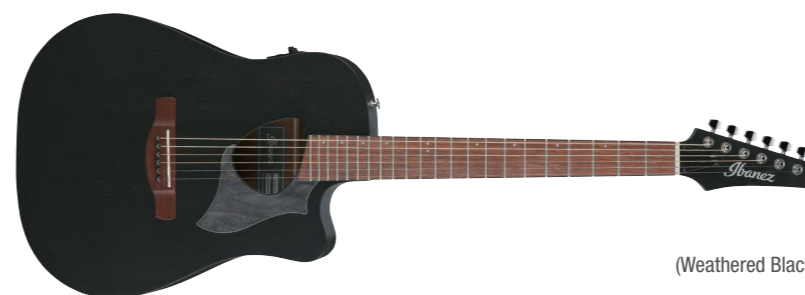
WK (Weathered Black Open Pore)