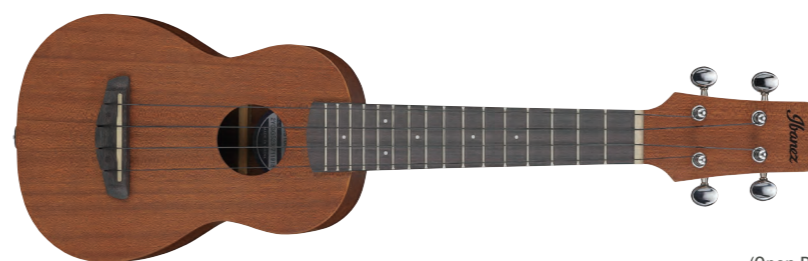
OPN (Open Pore Natural)