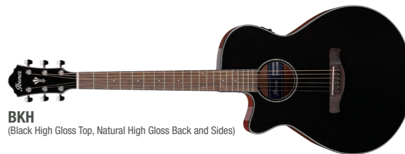
BKH (Black High Gloss Top, Natural High Gloss Back and Sides)