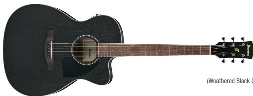
WK (Weathered Black Open Pore)