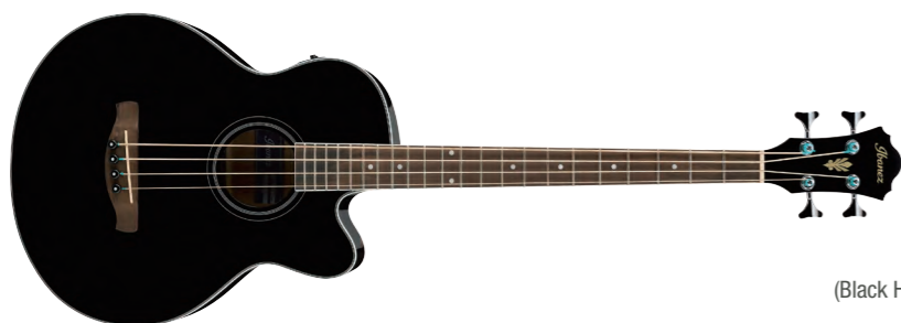
BK (Black High Gloss)