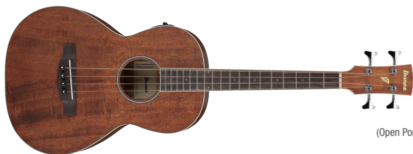
OPN (Open Pore Natural)