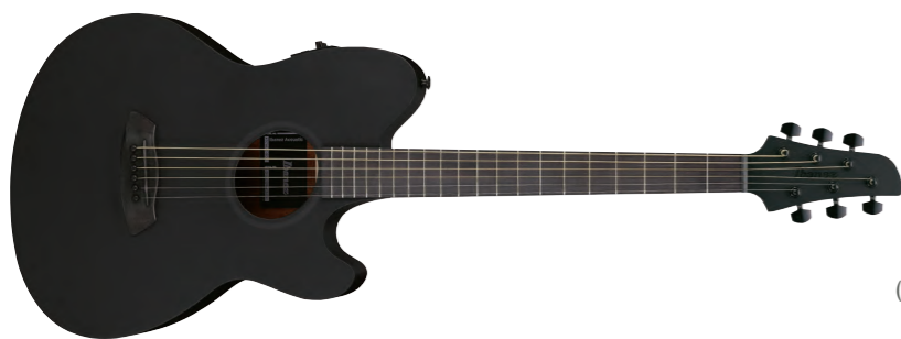
BOT (Black Out)