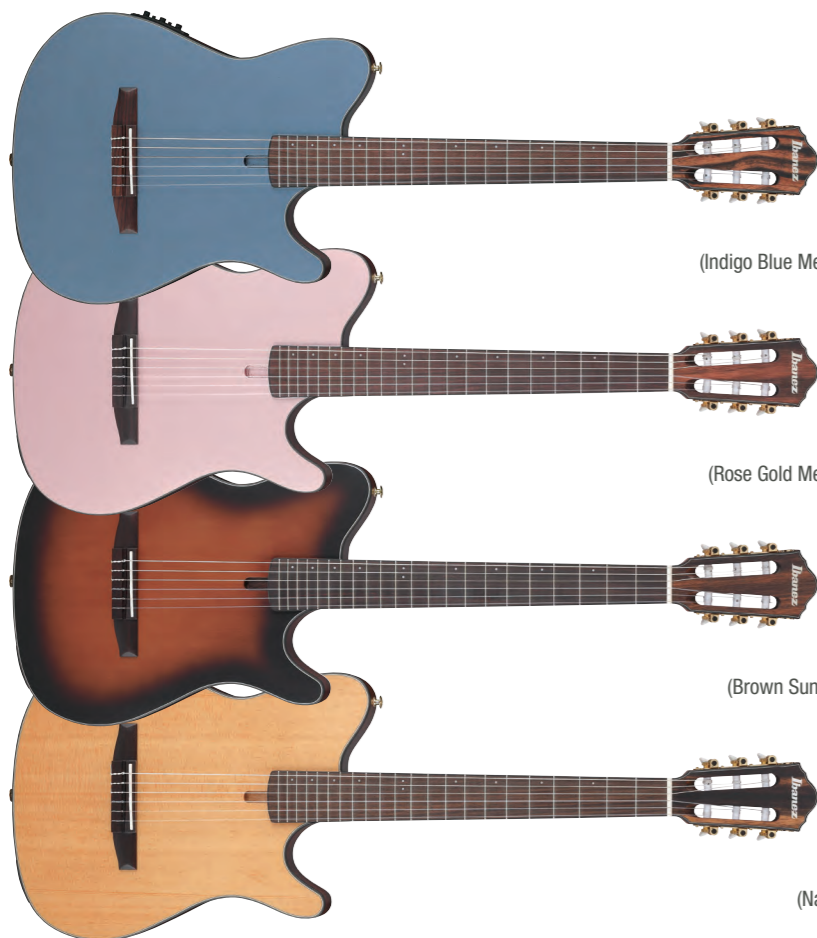
IBF (Indigo Blue Metallic Flat)