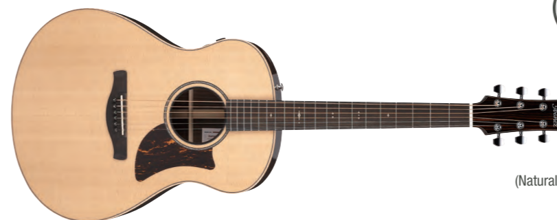
NT (Natural High Gloss)