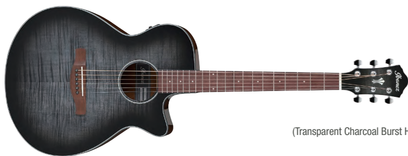
TCH (Transparent Charcoal Burst High Gloss)