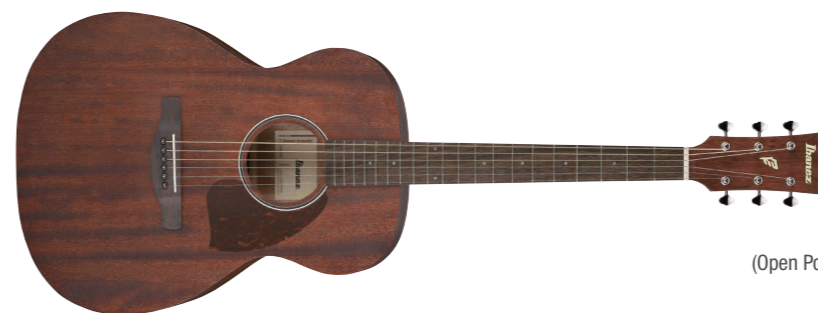
OPN (Open Pore Natural)