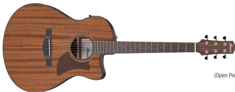
OPN (Open Pore Natural)