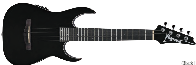
BK (Black High Gloss)