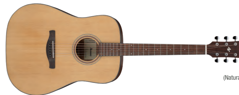
LG (Natural Low Gloss)