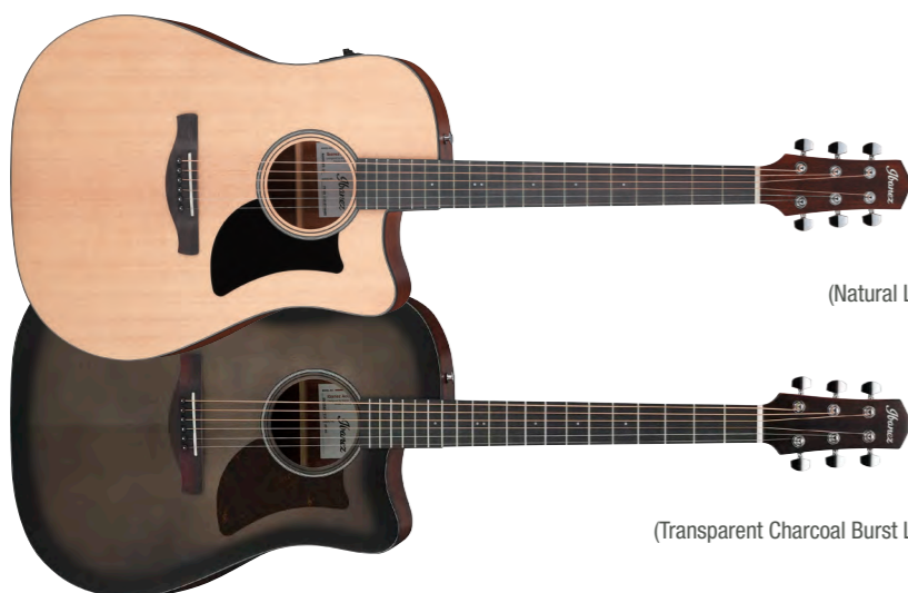
LG (Natural Low Gloss)