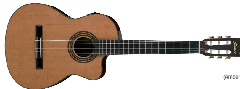
AM (Amber High Gloss)