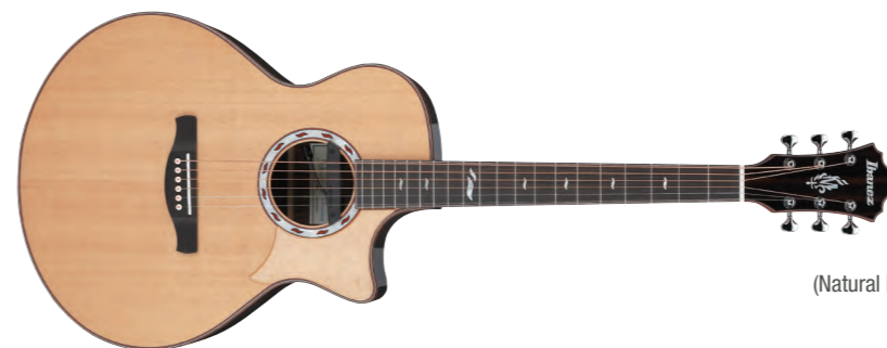
NT (Natural High Gloss)