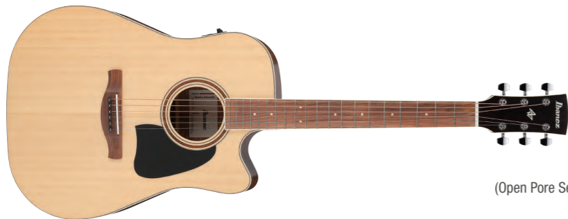
OPS (Open Pore Semi-Gloss)