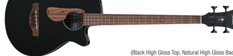
BKH (Black High Gloss Top, Natural High Gloss Back and Sides)