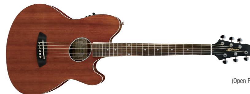
OPN (Open Pore Natural)