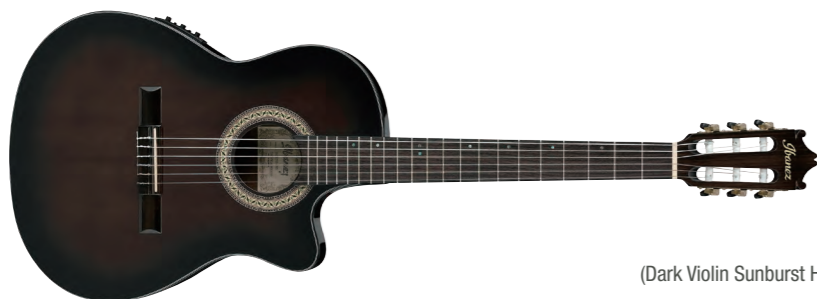
DVS (Dark Violin Sunburst High Gloss)