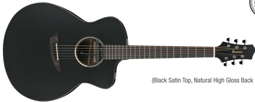
BSN (Black Satin Top, Natural High Gloss Back and Sides)