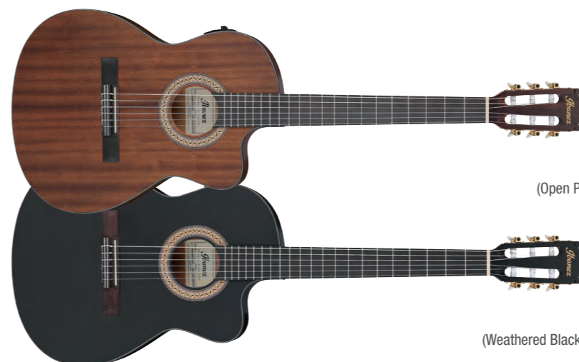
OPN (Open Pore Natural)