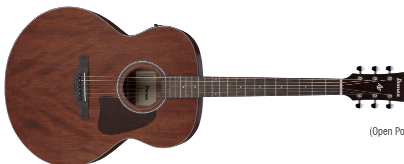
OPN (Open Pore Natural)