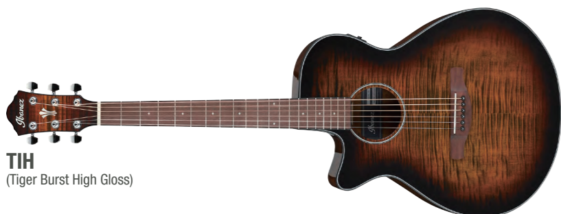
TIH (Tiger Burst High Gloss)