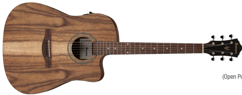
OPB (Open Pore Brown)