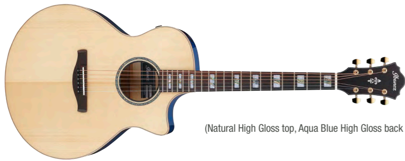
(Natural High Gloss top, Aqua Blue High Gloss back and sides)