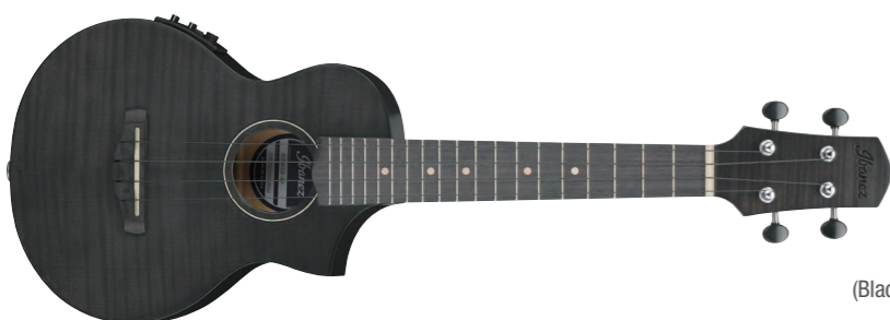
BIF (Black Ice Flat)