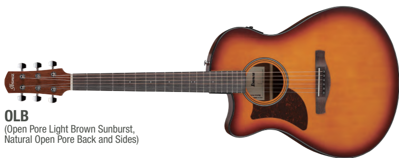
OLB (Open Pore Light Brown Sunburst, Natural Open Pore Back and Sides)