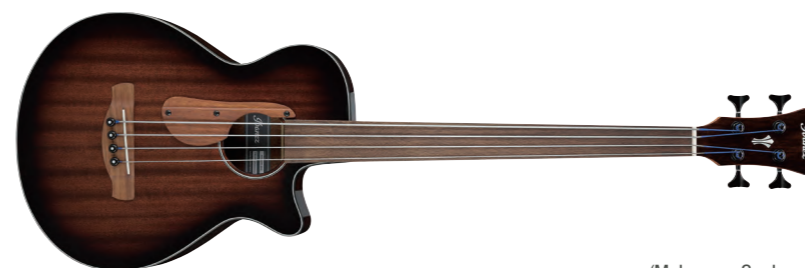
MHS (Mahogany Sunburst High Gloss)