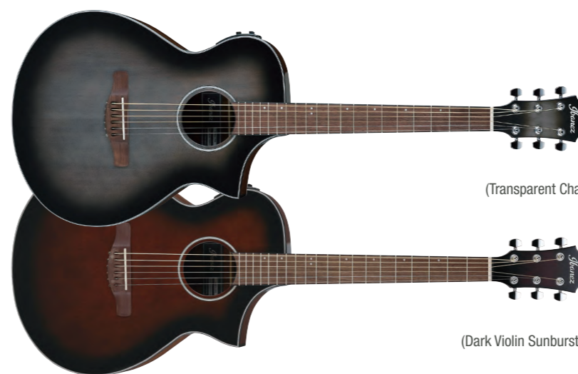
TCB (Transparent Charcoal Burst)