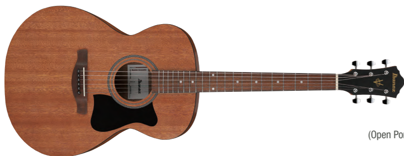
OPN (Open Pore Natural)