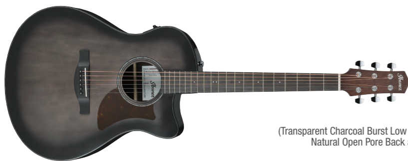
TBN (Transparent Charcoal Burst Low Gloss Top, Natural Open Pore Back and Sides)