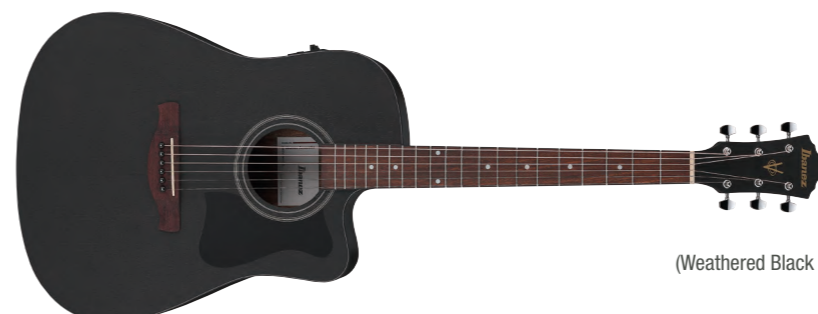
WK (Weathered Black Open Pore)