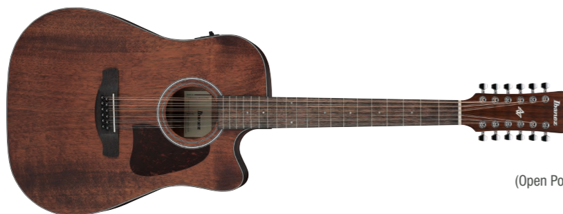
OPN (Open Pore Natural)