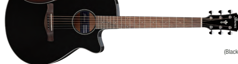
BK (Black High Gloss)