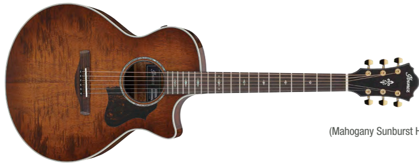
(Mahogany Sunburst High Gloss)