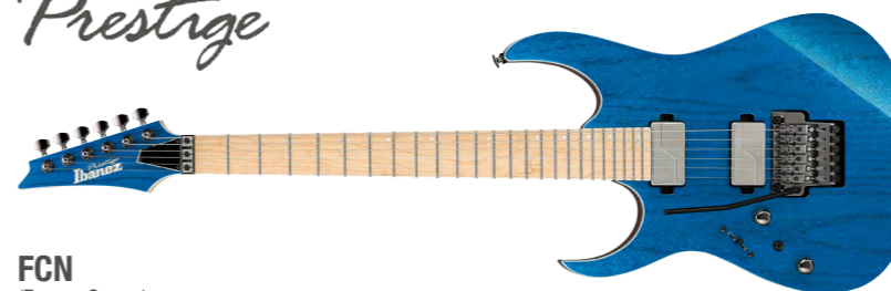
FCN (Frozen Ocean)