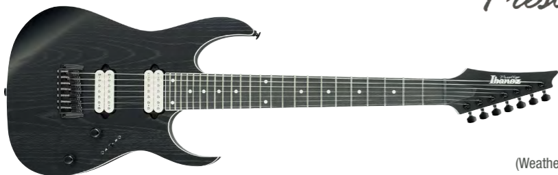
Prestige WK (Weathered Black)