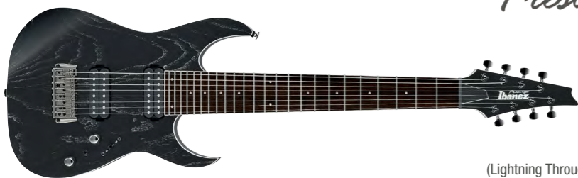
Prestige LDK (Lightning Through A Dark)