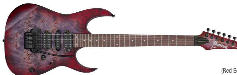
REB (Red Eclipse Burst)