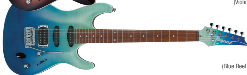
BRG (Blue Reef Gradation)