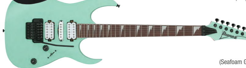
SFM (Seafoam Green Matte)