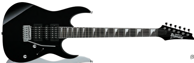
BKN (Black Night)