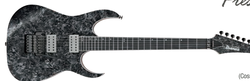
CSW (Cosmic Shadow)