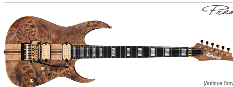
Premium ABS (Antique Brown Stained)