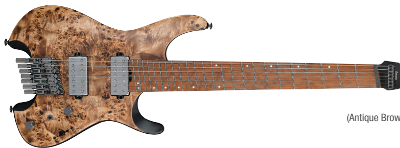
ABS (Antique Brown Stained)