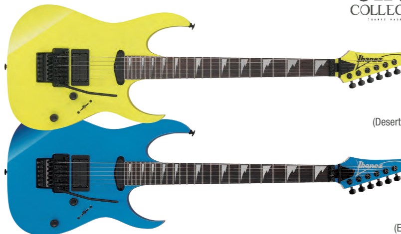
GENESIS COLLECTION DY (Desert Sun Yellow) EB (Electric Blue)