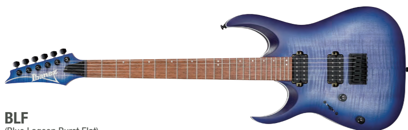
BLF (Blue Lagoon Burst Flat)