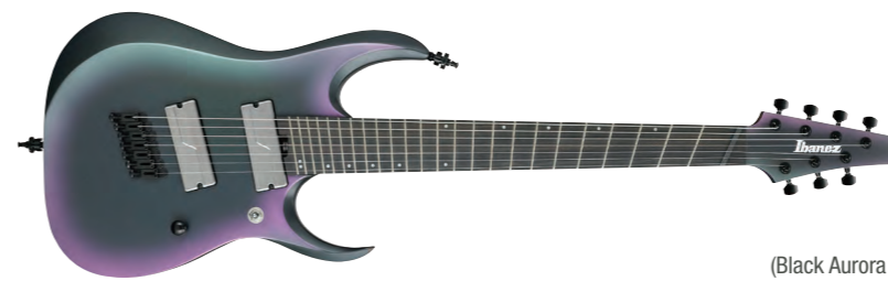
BAM (Black Aurora Burst Matte)