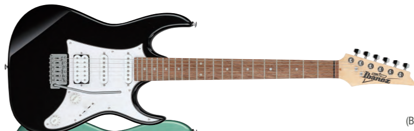
BKN (Black Night)