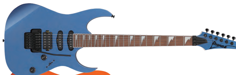
BLH (Blue Haze)