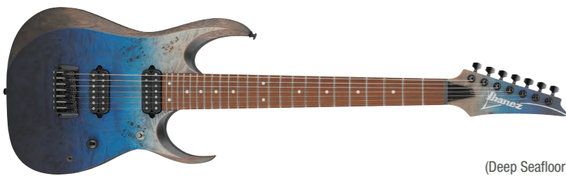
DSF (Deep Seafloor Fade Flat)