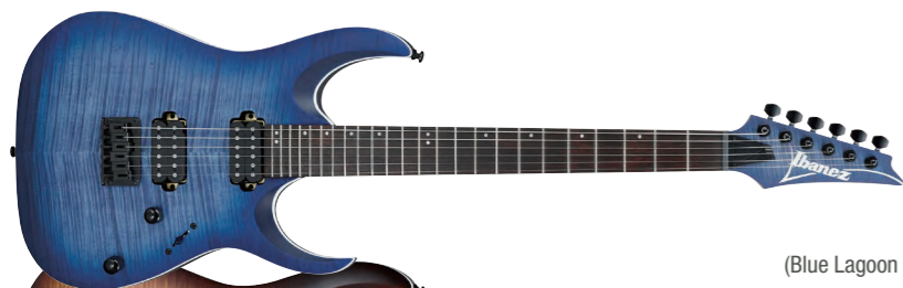
BLF (Blue Lagoon Burst Flat)