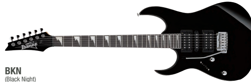
BKN (Black Night)