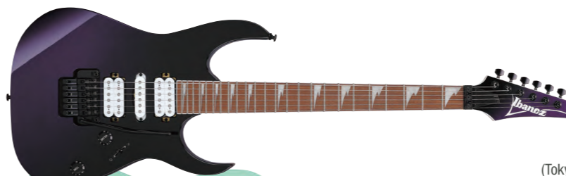
TMN (Tokyo Midnight)