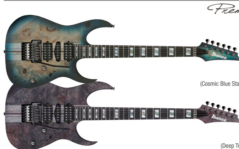
Premium CTF (Cosmic Blue Starburst Flat)