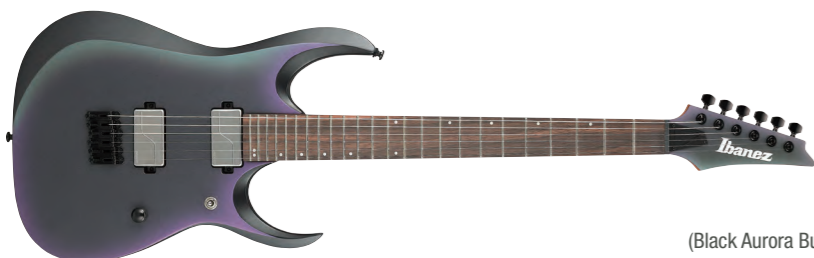
BAM (Black Aurora Burst Matte)