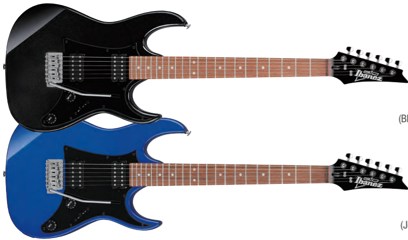
BKN (Black Night)