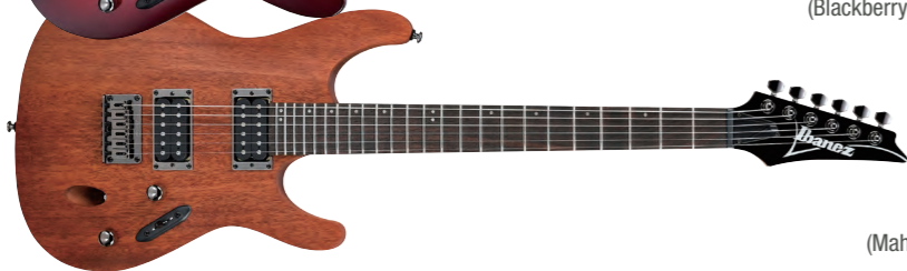
MOL (Mahogany Oil)