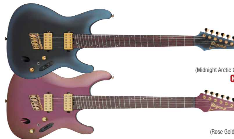
MAM (Midnight Arctic Ocean Matte)