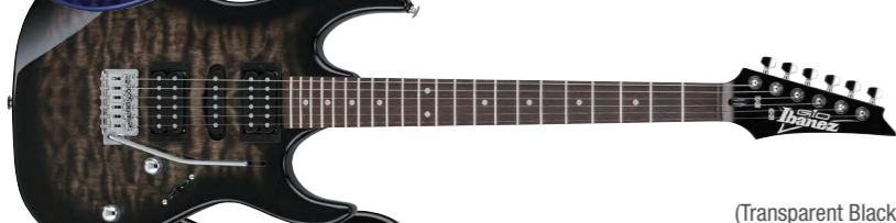
TKS (Transparent Black Sunburst)