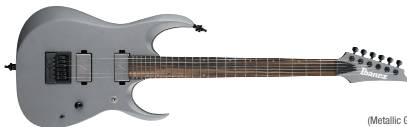
MGM (Metallic Gray Matte)