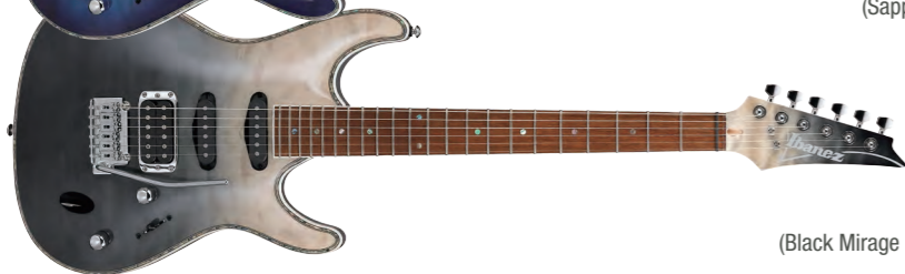
BMG (Black Mirage Gradation)