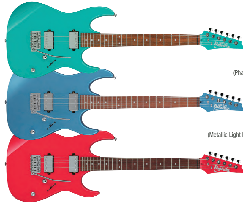
PBL (Phantom Blue)