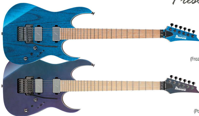
FCN (Frozen Ocean)