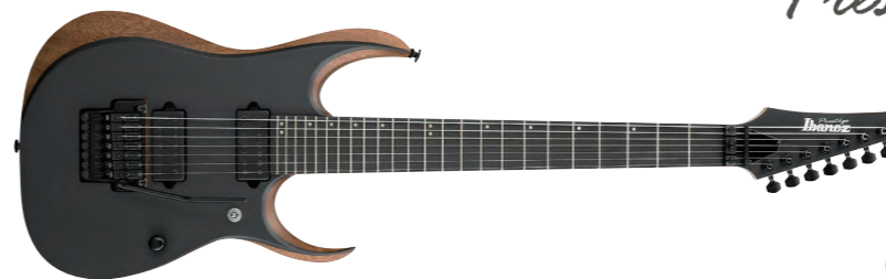
NTF (Natural Flat)