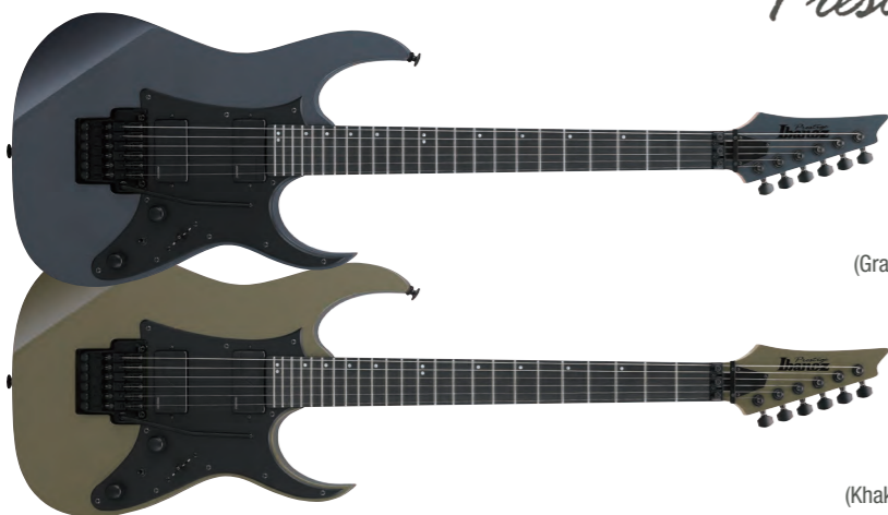
GRM (Gray Metallic)