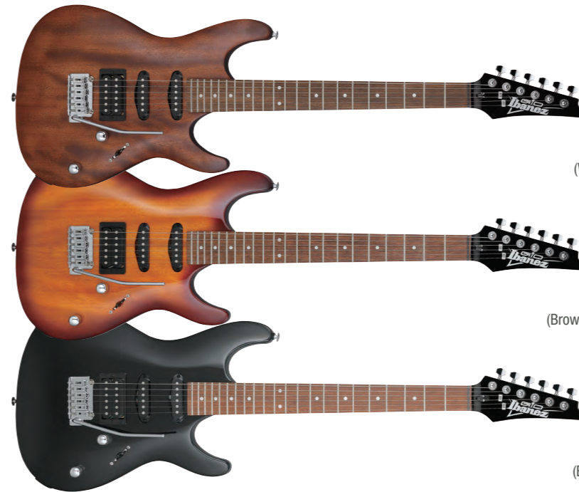
WNF (Walnut Flat)