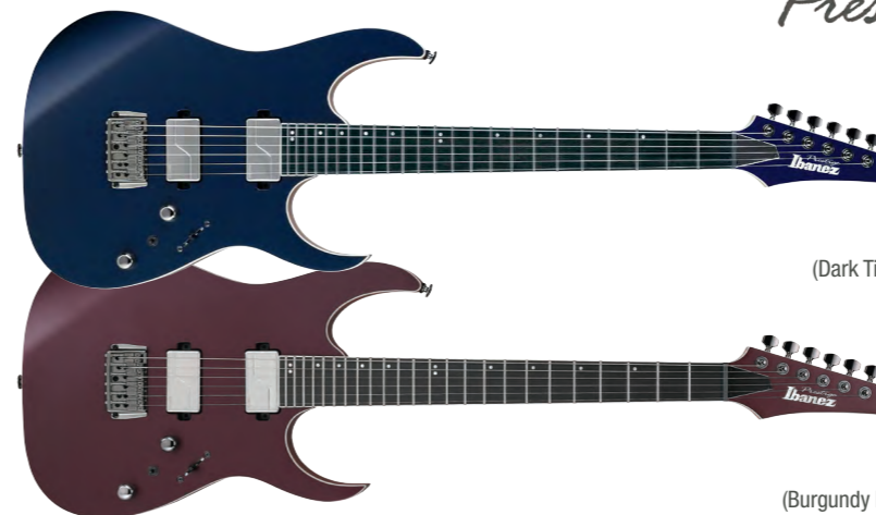
BCF (Burgundy Metallic Flat)