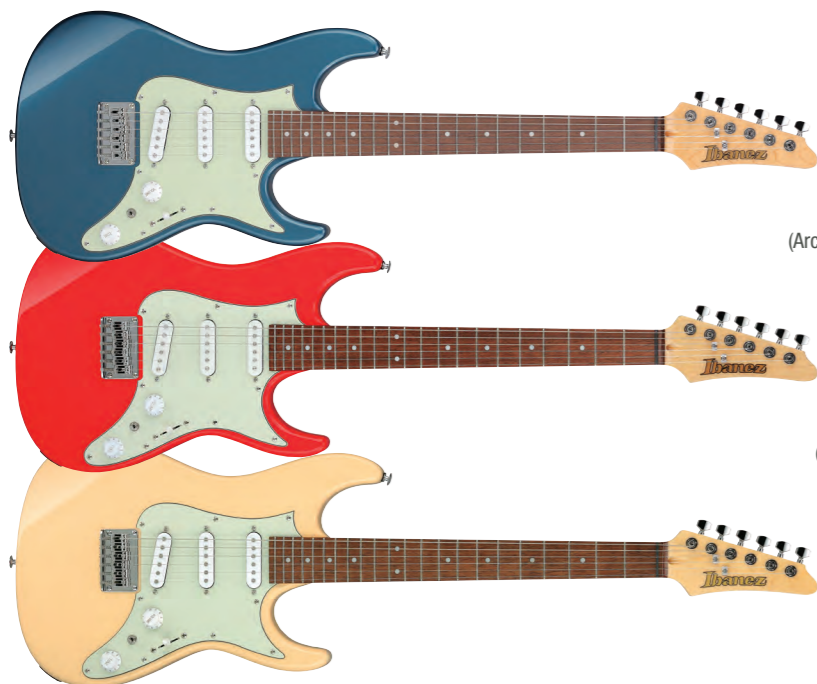
AOC (Arctic Ocean)