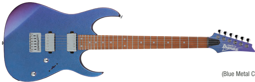
BMC (Blue Metal Chameleon)