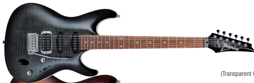
TGB (Transparent Gray Burst)