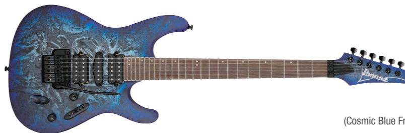
CZM (Cosmic Blue Frozen Matte)