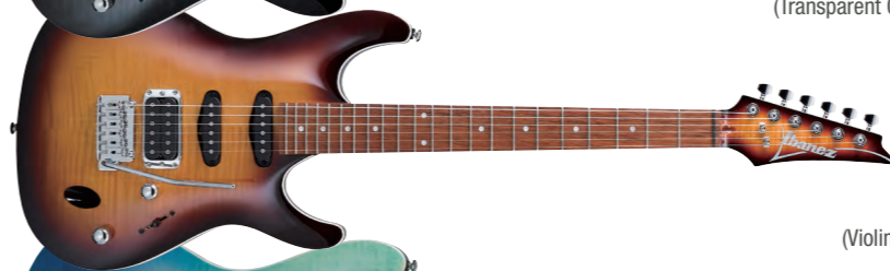
VLS (Violin Sunburst)