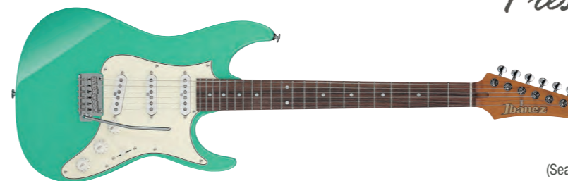
SFG (Seafoam Green)