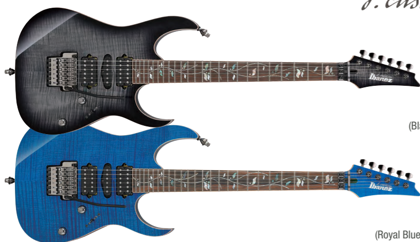
BRE (Black Rutile)