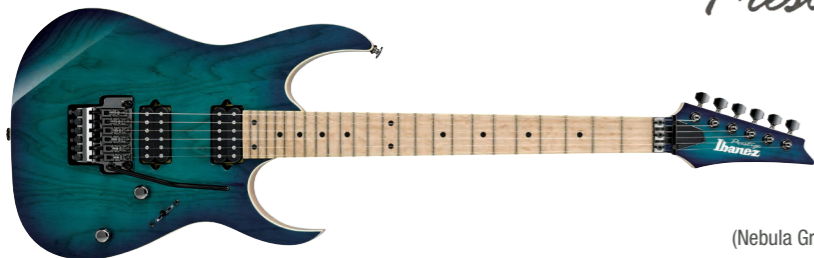
Prestige NGB (Nebula Green Burst)