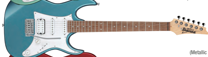
MLB (Metallic Light Blue)