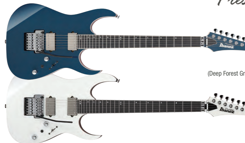
DFM (Deep Forest Green Metallic)