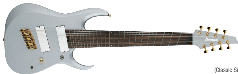
CSM (Classic Silver Matte)