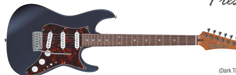
DBF (Dark Tide Blue Flat)