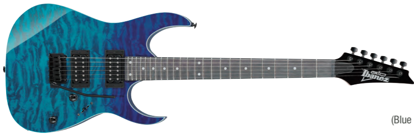
BGD (Blue Gradation)