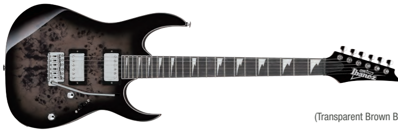
BKB (Transparent Brown Black Burst)