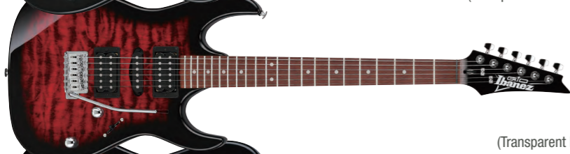
TRB (Transparent Red Burst)