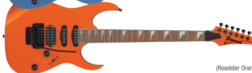
ROM (Roadster Orange Metallic)