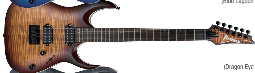
DEF (Dragon Eye Burst Flat)