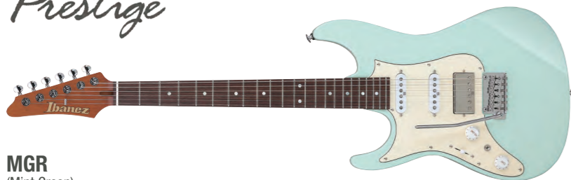
MGR (Mint Green)