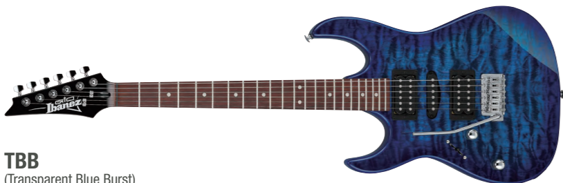
TBB (Transparent Blue Burst)