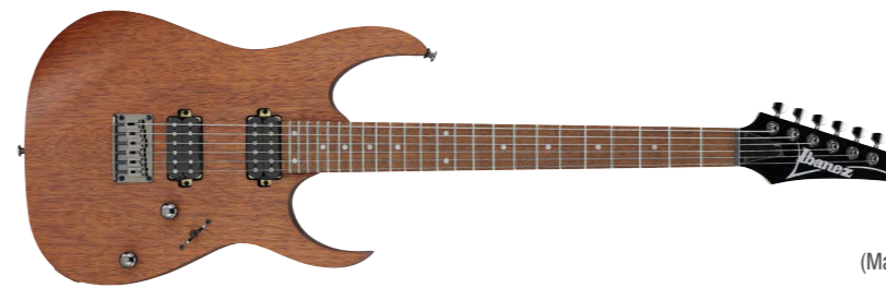
MOL (Mahogany Oil)