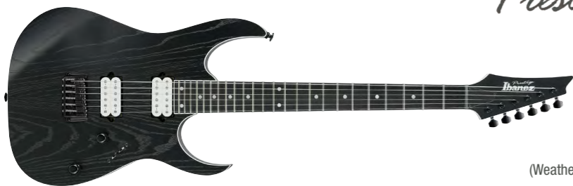
Prestige WK (Weathered Black)