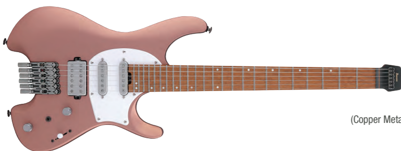
CMM (Copper Metallic Matte)