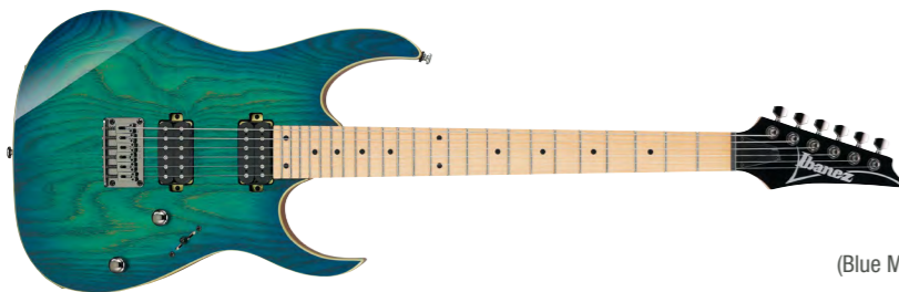
BMT (Blue Moon Burst)