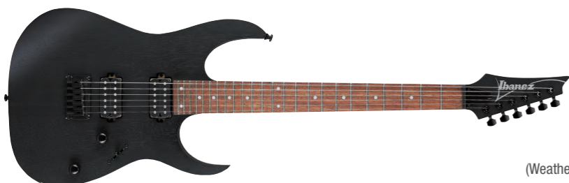
WK (Weathered Black)