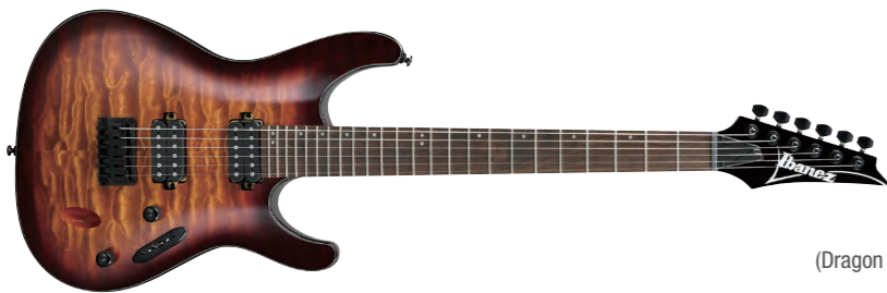
DEB (Dragon Eye Burst)