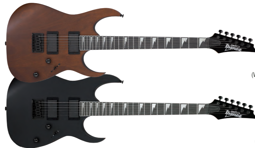
WNF (Walnut Flat)