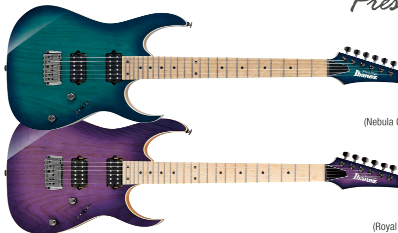
Prestige NGB (Nebula Green Burst) RPB (Royal Plum Burst)