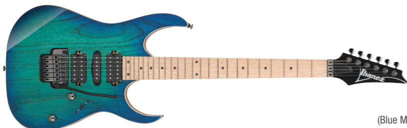
BMT (Blue Moon Burst)