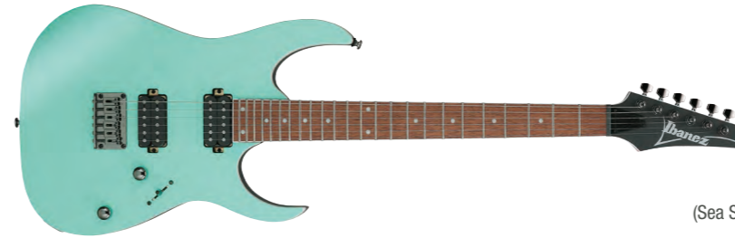
SEM (Sea Shore Matte)