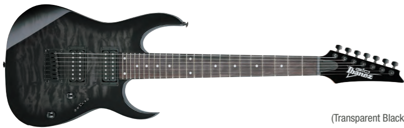
TKS (Transparent Black Sunburst)