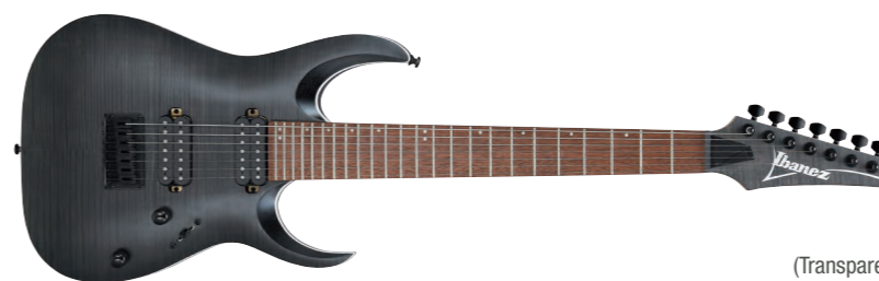
TGF (Transparent Gray Flat)