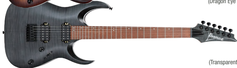
TGF (Transparent Gray Flat)