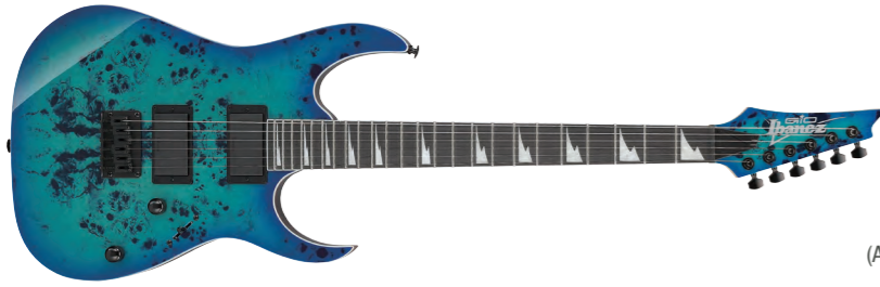
AQB (Aqua Burst)