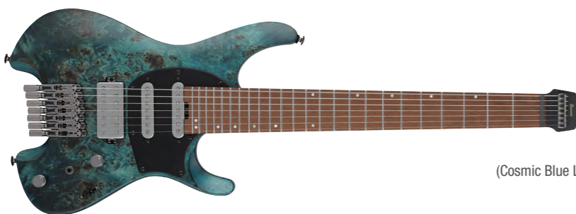
COL (Cosmic Blue Low Gloss)