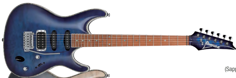
SPB (Sapphire Blue)