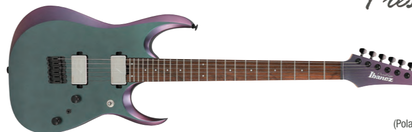
PRF (Polar Lights Flat)