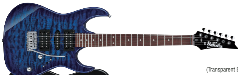
TBB (Transparent Blue Burst)