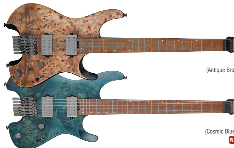
ABS (Antique Brown Stained)