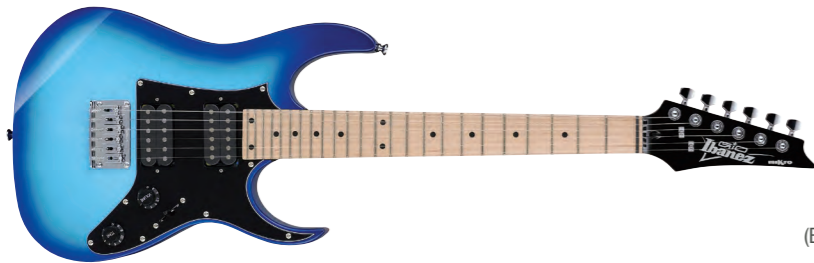
BLT (Blue Burst)