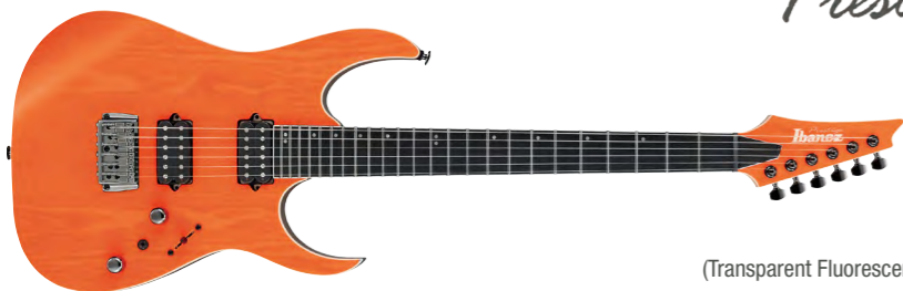
TFR (Transparent Fluorescent Orange)