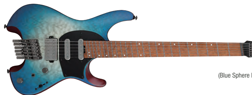
BSM (Blue Sphere Burst Matte)