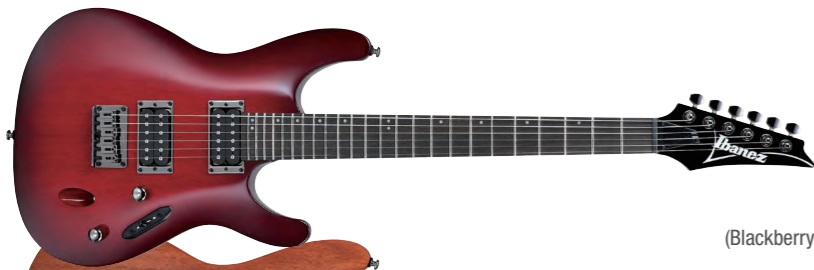
BBS (Blackberry Sunburst)