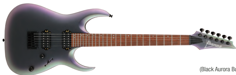
BAM (Black Aurora Burst Matte)