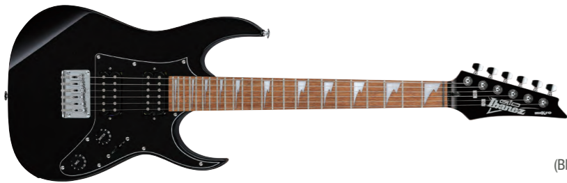
BKN (Black Night)