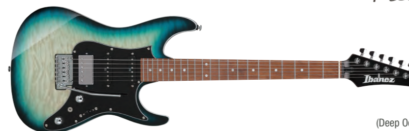
DOB (Deep Ocean Blonde)