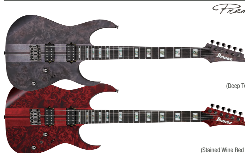
Premium DTF (Deep Twilight Flat)