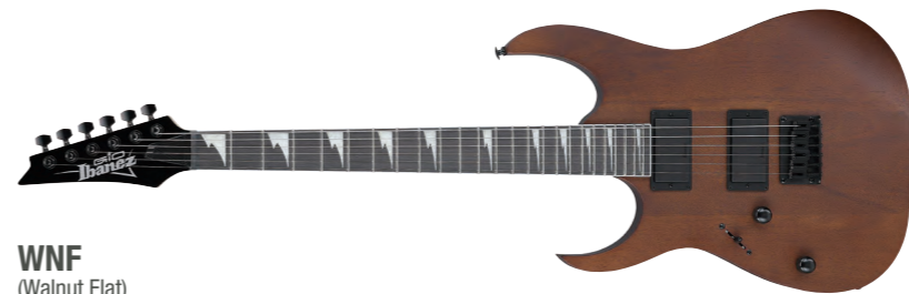
WNF (Walnut Flat)