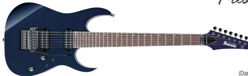
Prestige DTB (Dark Tide Blue)