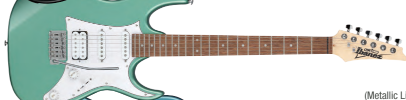
MGN (Metallic Light Green)