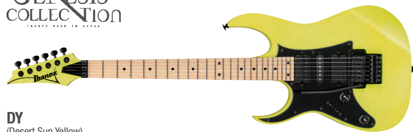
DY (Desert Sun Yellow)

Left-handed GENESIS COLLECTION MADE IN JAPAN