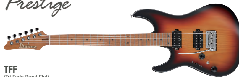
TFF (Tri Fade Burst Flat)