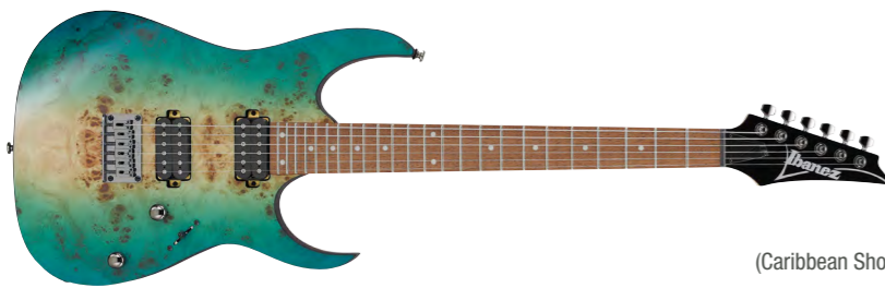
CHF (Caribbean Shoreline Flat)