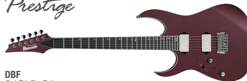
DBF (Dark Tide Blue Flat)