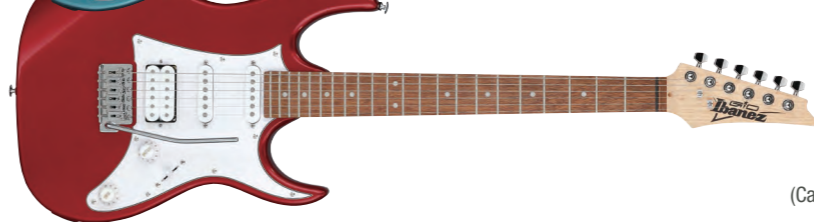
CA (Candy Apple)